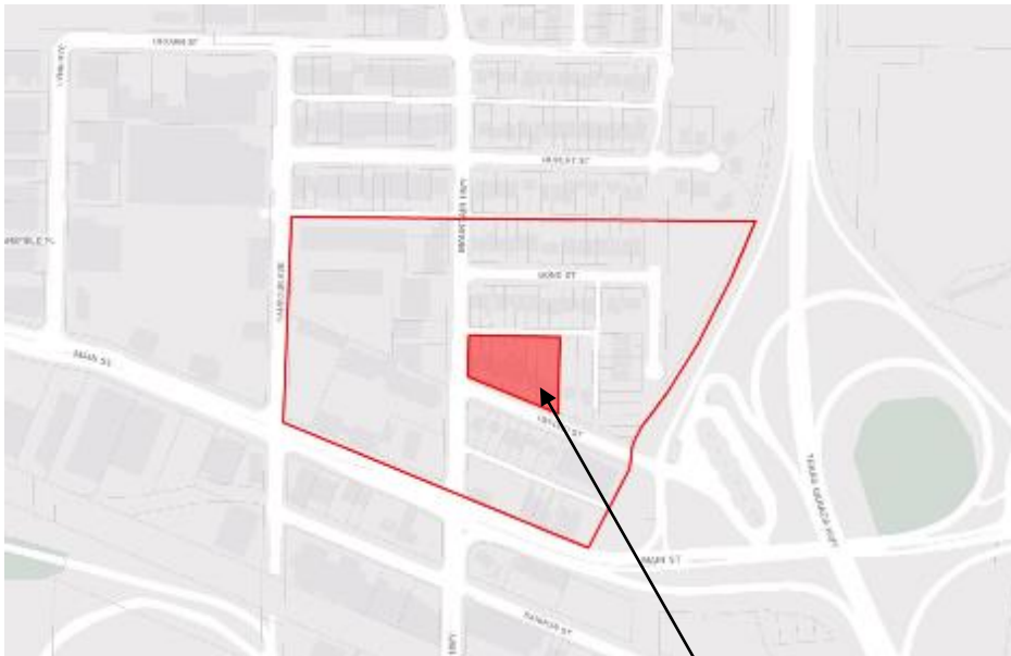
Creekstone Care Centre Site

The District Official Community Plan designates the site as Residential Level 5 Low Density Apartments. The site is zoned RS-4 Single Family Residential and the owner proposes to rezone the site to a site specific CD Comprehensive Development Zone.